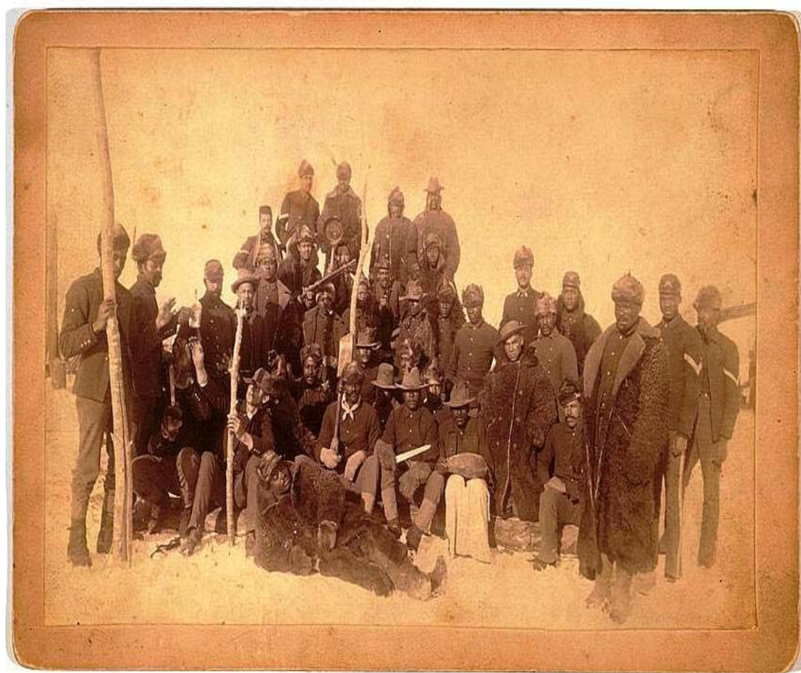
Figure 9. The 25 th Infantry poses for a photo.