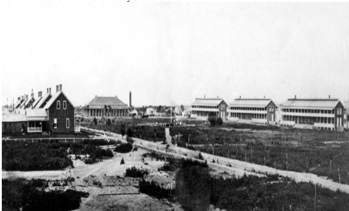
Figure 6. An angled shot of Fort Brown in 1906. Major Penrose’s quarters are located in the center of this photo.

disappearing for the next two and half hours. According to court documents, Macklin ordered the trumpeter-of-the-guard to wake him at reveille at 5:00 a.m. This is important to understand, due to the fact that if any situation arises at the fort, the trumpeter-of-the-guard must play “call-to-arms” to alert the soldiers in the fort that they are under attack. If the trumpeter-of-the-guard is busy locating Macklin or performing some other mundane task and the fort comes under attack or duress, then there will be no one to notify the soldiers. 65