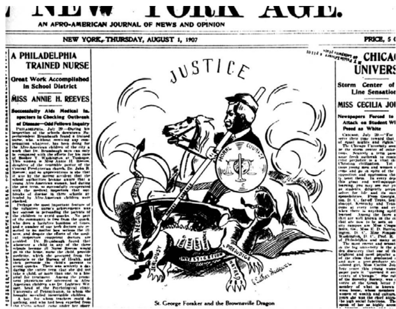
Figure 3. A political cartoon describing Senator Joseph Foraker’s slaying the gigantic Brownsville investigation.

Ohio Senator Joseph Foraker, a 1908 presidential candidate, took up the case for the discharged soldiers and in the process a heated debate began between him and the president. On the senate floor Foraker laid out the facts of the Brownsville incident. He stated that there were only eight legitimate witnesses instead of scores of witnesses that came out of the woodworks to convict black soldiers. He looked for evidence that confirmed the soldiers’ guilt and found none.