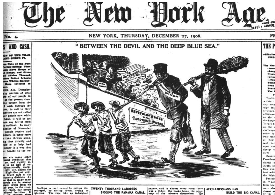
Figure 2. Political cartoons in the black press expressing dissatisfaction about the incident in Brownsville.

Sergeant Holliday charged that Roosevelt's comments were uncalled for, uncharitable, and ungrateful. 57