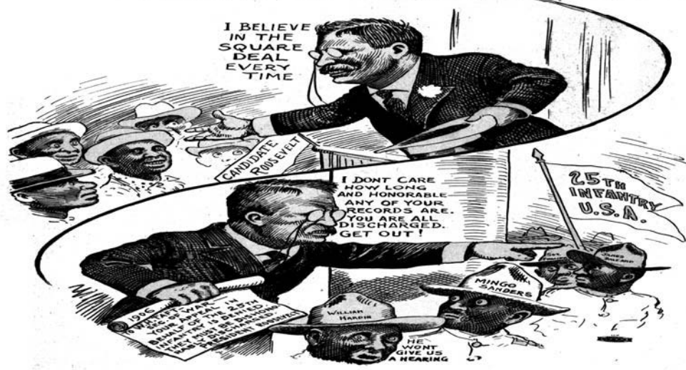
Figure 1. The contradiction of Theodore Roosevelt as a candidate and as President of the United States.

Moreover, Roosevelt's perception on race was considered progressive in 1906. As a progressive New Yorker, Roosevelt believed that blacks, as well as whites, were men. "It is of the utmost importance to all our people that we shall deal with each man on his merits as a man, and not deal with him merely as a member of a given race; that we shall judge each man by his conduct and not his color. This is important for the white man, and it is far more important for the colored man." 51 Yet, Roosevelt was known as a "walking contradiction" who normally vouched on one side of an issue and then later stood on the other side of the same issue. Theodore Roosevelt, a veteran of the United States Volunteers 1 st Calvary, at times, made numerous declarations for and against black troops. He often inferred that black troops depended heavily upon their white officers and