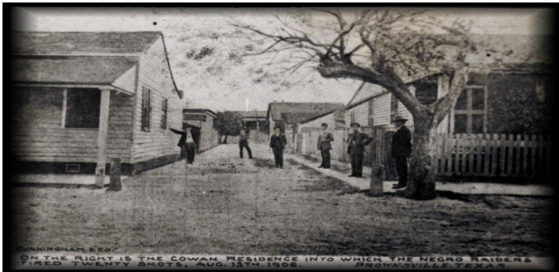
Figure 7. On the right of the photo is the Cowan residence where the first shots of the raid landed in 1906.